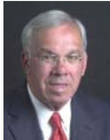
Mayor Thomas Menino

For his significant contribution to the areas of clean water legislation, public policy and government service as Mayor of the City of Boston