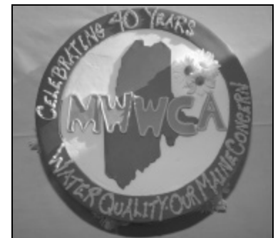
MWWCA 40th Anniversary cake at the MWWCA Fall Conference