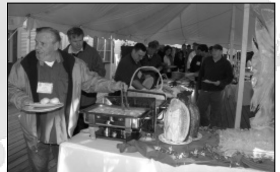
Supper line at the pig roast at the 40th Anniversary MWWCA Fall Conference